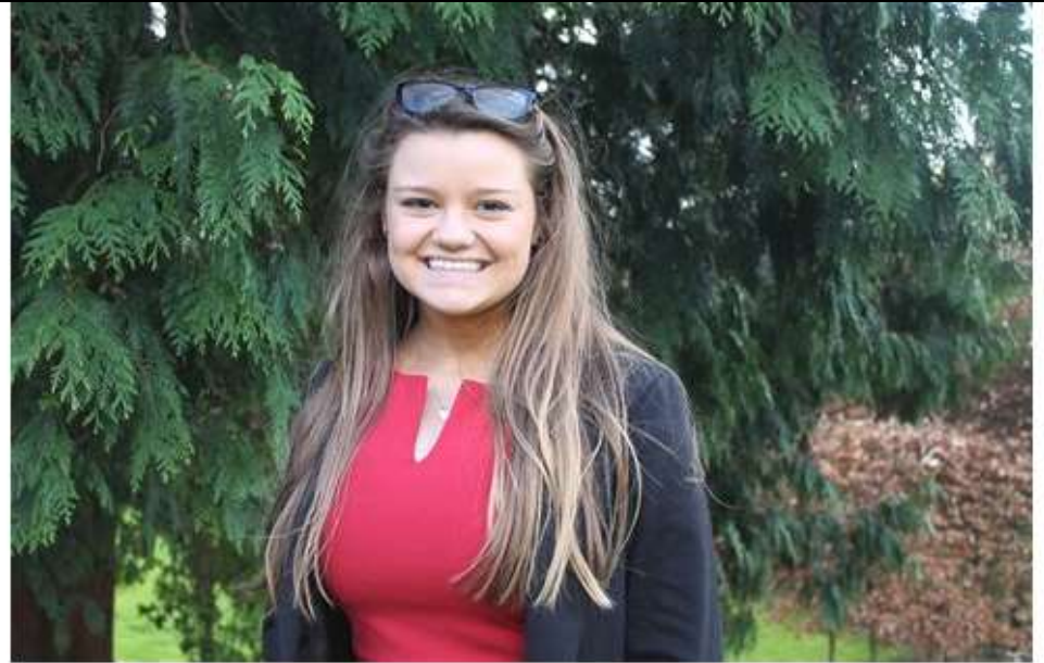
Autumn Beats Off The Competition To Land Prestigious Rolls Royce Commercial Apprenticeship